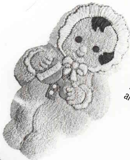
Cute Baby (feature) Use tips 3, 16; Wilton Icing Colors in Lemon Yellow, Leaf Green, Creamy Peach and Brown.

Decorating is easy with Wilton! Choose from our complete assortment of decorating accessories including icing decorating colors, ready-to-use icing, icing decorations and quality products. For more decorating ideas and quality products, see the current Wilton Yearbook of Cake Decorating.