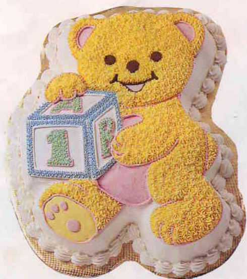
Teddy Bear With Block (Feature) Uses tips 3, 16, 21 and Wilton Icing Colors in Golden Yellow, Brown, Pink, Kelly Green and Royal Blue.

For more decorating ideas and quality products, see the current Wilton Yearbook of Cake Decorating.