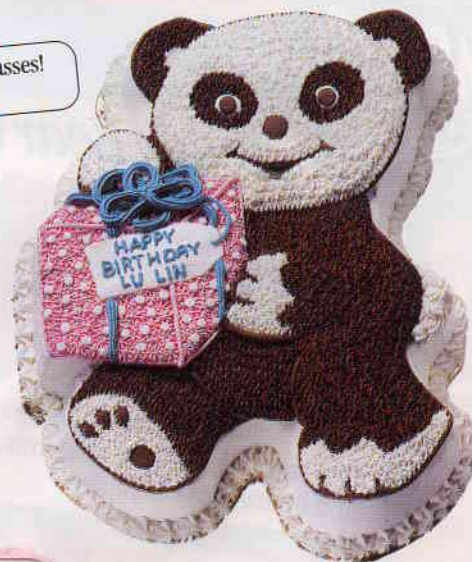
Presenting Panda Use tips 2, 4, 16, 21 and Wilton Icing Colors in Brown, Pink and Teal.