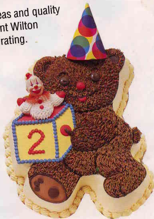
Bear's Birthday Surprise Use tips 3, 5, 18, 32, 233 and Wilton Icing Colors in Lemon Yellow, Royal Blue, Christmas Red and Brown.

Wilton Method Cake Decorating Classes! Call: 1-800-942-8881