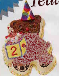
Bear's Birthday Surprise