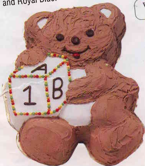
Teddy's Toy Use tips 3, 21 and Wilton Brown Icing Color.

Wilton Method Cake Decorating Classes! Call: 1-800-942-8881