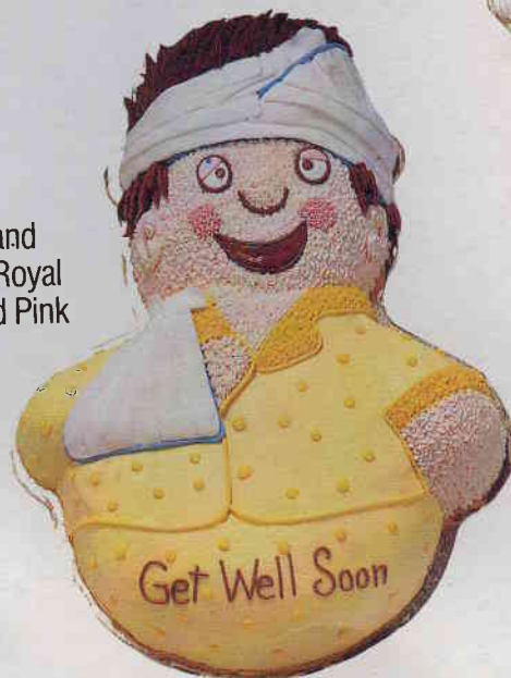
▶ Poor Guy Tips 3, 16, 125 and Lemon Yellow, Royal Blue, Brown and Pink Icing Colors.