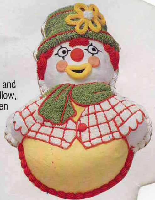
▶ Zany Clown Tips 3, 12, 18, 21 and Wilton Lemon Yellow, Orange, Leaf Green and Black Icing Colors.