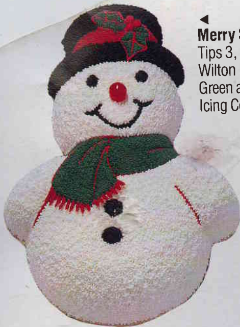
◀ Merry Snowman Tips 3, 16, 21 and Wilton Red, Kelly Green and Black Icing Colors.

Wilton Method Cake Decorating Classes! Call: 1-800-942-8881