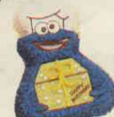
Cookie Monster with Gift