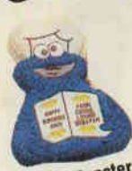
Cookie Monster with Greeting Card