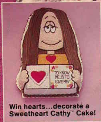
Win hearts...decorate a Sweetheart Cathy™ Cake!