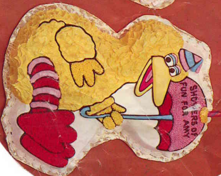
Fowl-Weather Friend Design shown uses tips 4, 12, 16, 18 and Paste Food Colors in Lemon Yellow, Pink, Brown, Orange, Red-Red and Sky Blue.