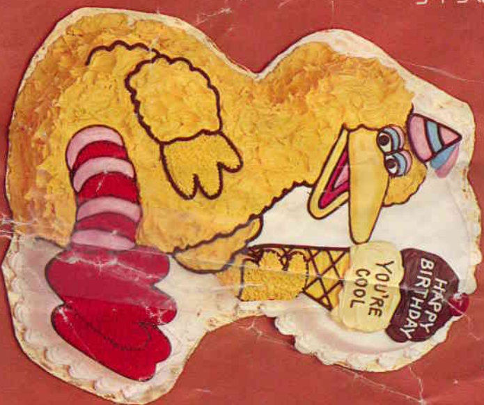
Cool Guy Design shown uses tips 4, 12, 16, 18 and Paste Food Colors in Lemon Yellow, Pink, Brown, Orange, Red-Red and Sky Blue.