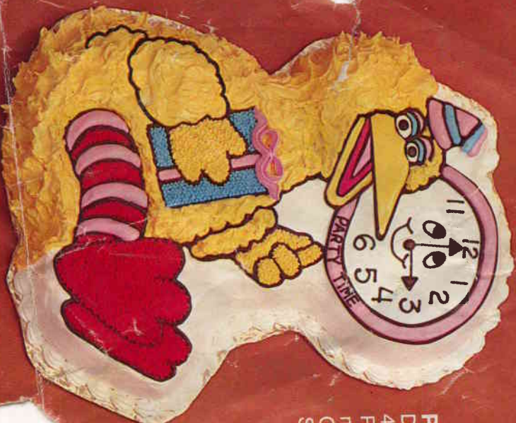
Party-Time Buddy Design shown uses tips 4, 12, 16, 18, 102 and Paste Food Colors in Lemon Yellow, Pink, Brown, Orange, Red-Red and Sky Blue.