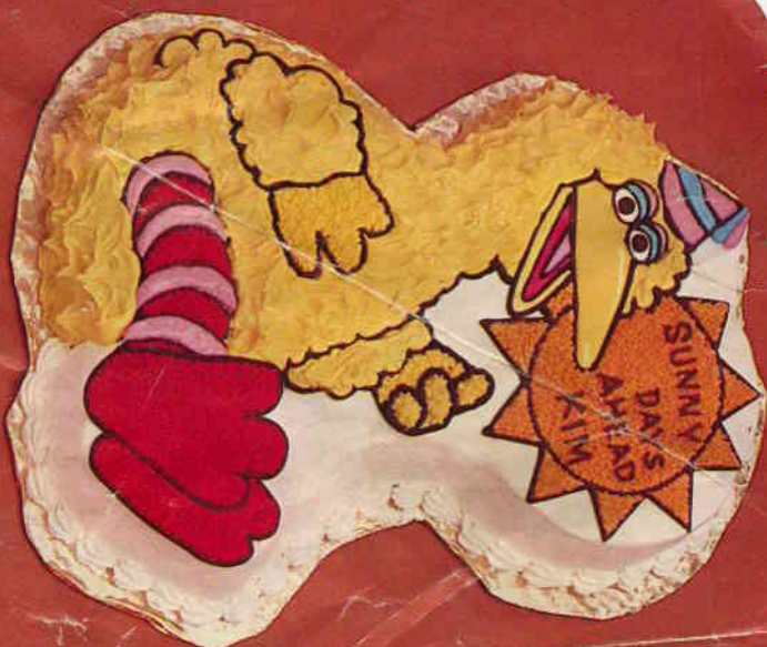
Sunshine Pal Design shown uses tips 4, 12, 16, 18 and Paste Food Colors in Lemon Yellow, Pink, Brown, Orange, Red-Red, Golden Yellow and Sky Blue.