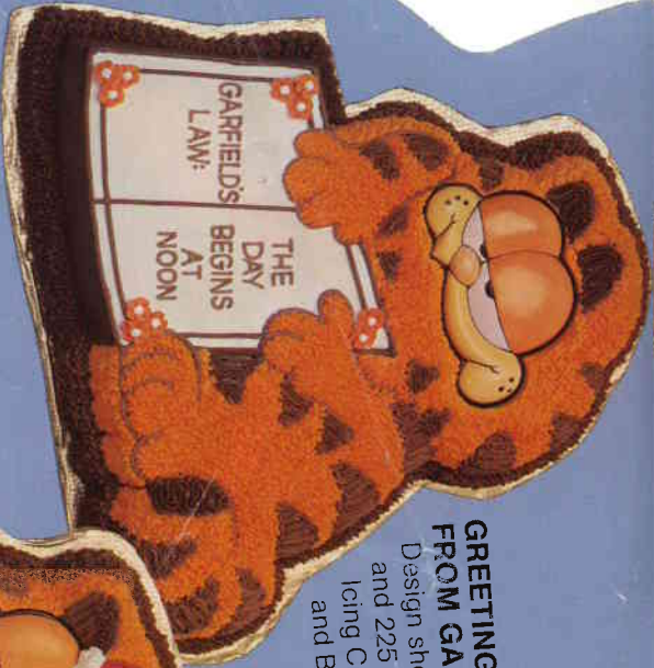
GREETINGS FROM GARFIELD® Design shown uses tips 3, 16, 18 and 225 and Wilton Paste Icing Colors in Golden Yellow and Brown.