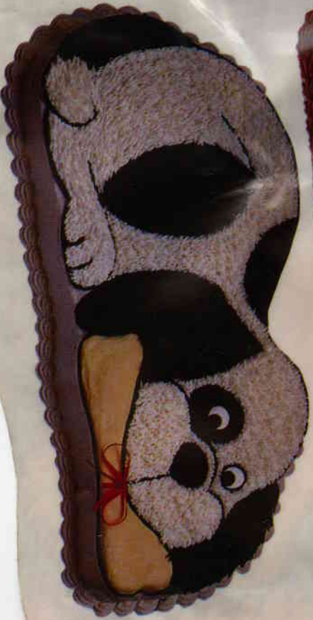
▶ Hiss The Spot Use tips 4, 12, 21, 233 and Wilton Icing Colors Golden Yellow, Black.

©1987 Wilton Enterprises, Inc. Woodridge, IL 60517 Made in Korea