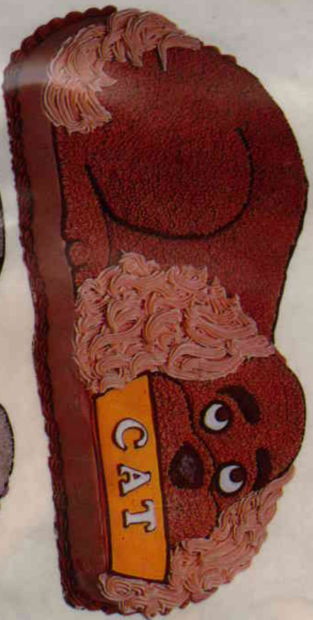
▶ Caught In The Act Use tips 4, 16, 21 and Wilton Icing Colors Golden Yellow, Brown.

For more decorating ideas and quality products, see the current Wilton Yearbook of Cake Decorating.