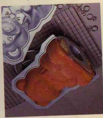
3. Bake and cool.