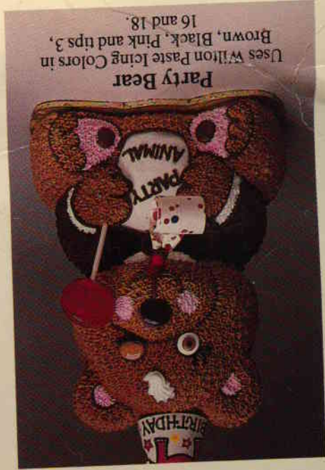
Party Bear Uses Wilton Paste Icing Colors in Brown, Black, Pink and tips 3, 16 and 18.

Here Are 3 More Ways To Decorate Your Teddy Bear Cake