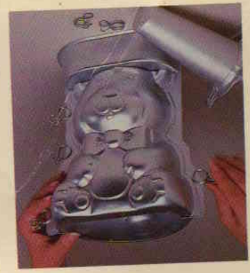
1. Assemble Pan.