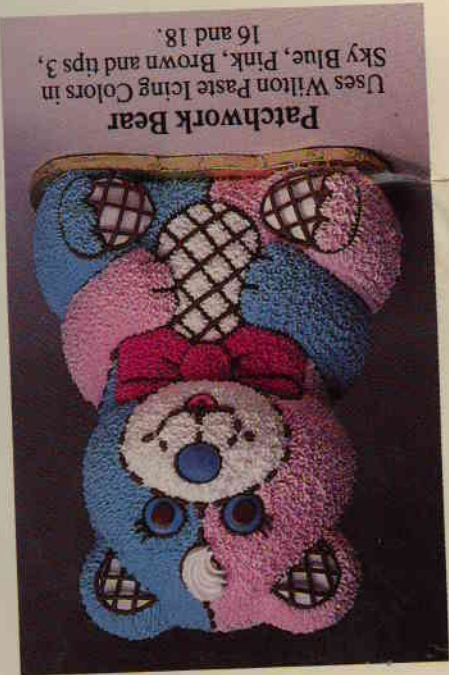
Patchwork Bear Uses Wilton Paste Icing Colors in Sky Blue, Pink, Brown and tips 3, 16 and 18.