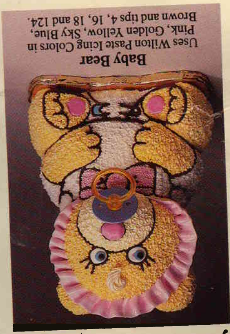
Baby Bear Uses Wilton Paste Icing Colors in Pink, Golden Yellow, Sky Blue, Brown and tips 4, 16, 18 and 124.