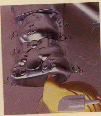
2. Pour in batter.