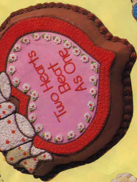
Orange, Pinks, Leaf Green