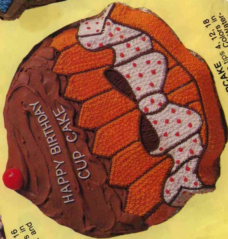
CUPCAKE Design shown uses tips 4, 12, 18 and Wilton Paste Icing Colors in Orange and Water