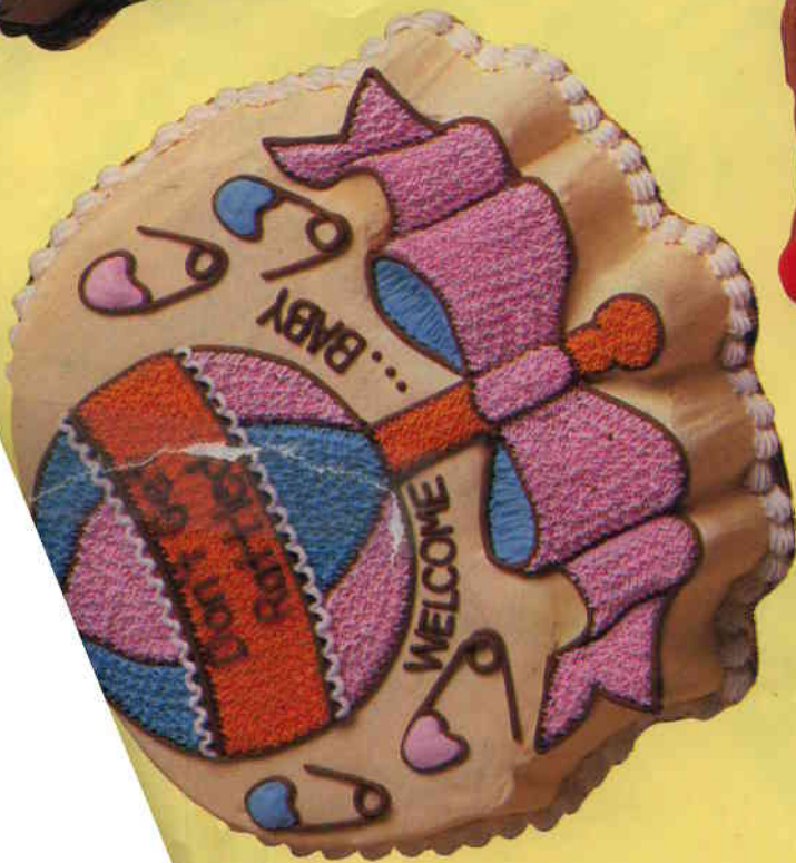
BABY'S FIRST TOY Design shown uses tips 4, 12, 16 and Wilton Paste Icing Colors in Golden Yellow, Brown, Pink and Sky Blue