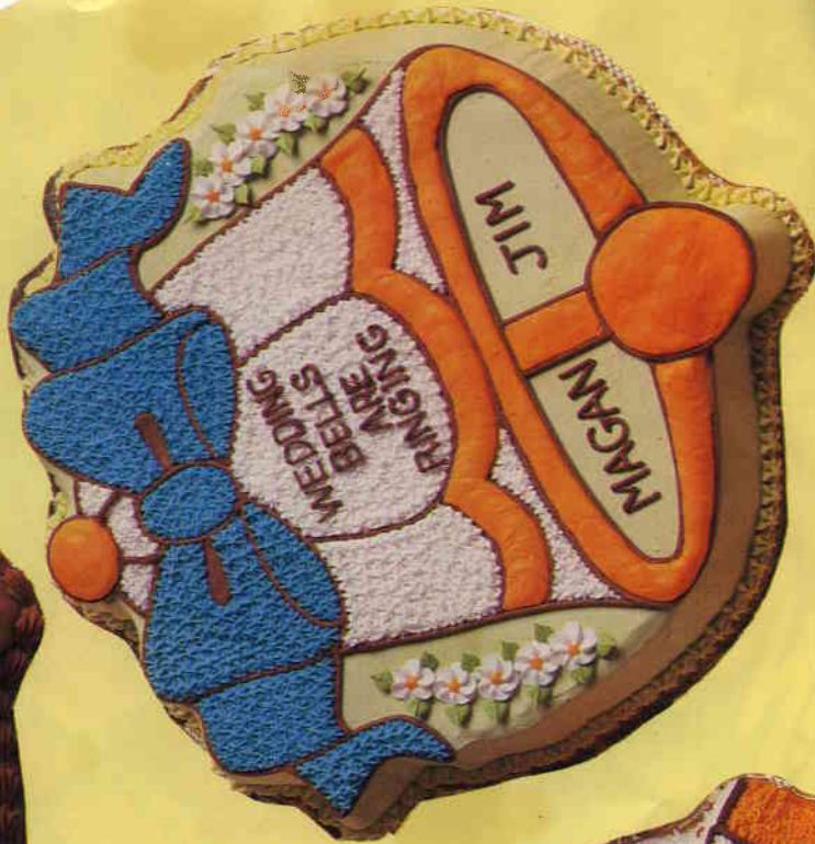
WEDDING BELL Design shown uses tips 2, 4, 12, 16, 18, 129, 352 and Wilton Paste and Colors in Brown, Golden Blue