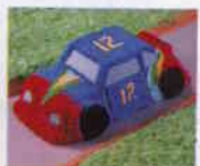
Drôle de Bolide

Instructions de cuisson et de décoration Gâteaux Berline 3D