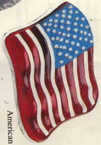
American Flag Gelatin