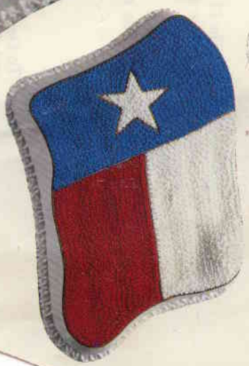
Texas State Flag Cake