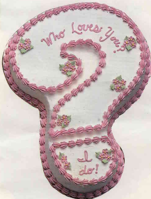
LOVE IS TRUE Design uses tips 3, 18, 225, 352 and Pink Paste Colors.