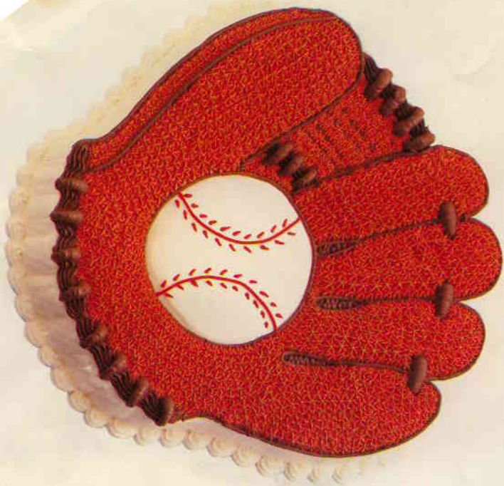
▲ Nice Catch (Feature) Use tips 3, 16, 21 and Wilton Paste Icing Colors in Brown, Copper and Wilton Red.

Baseball a super way to hit down... perfect for Here's a super way to hit down... perfect for your favorite baseball fan. Perfect for your favorite baseball fan. Perfect for birthdays, Father's Day, Mother's Day, birthdays, Father's Day, Mother's Day, tournament championships and more. tournament championships and more. For more decorating ideas and quality products, see For more decorating ideas and quality products, see the current Wilton Yearbook of Cake Decorating.