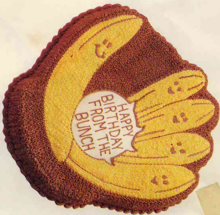
▲ Happy Bunch Use tips 3, 16, 21 and Wilton Paste Icing Colors in Golden Yellow and Brown.