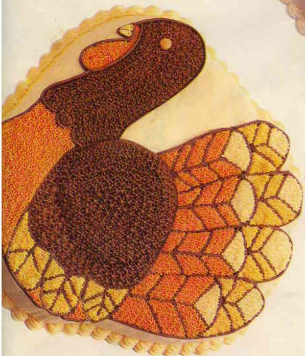
▲ Holiday Turkey Use tips 3, 16, 21 and Wilton Paste Icing Colors in Brown, Golden Yellow and Orange.