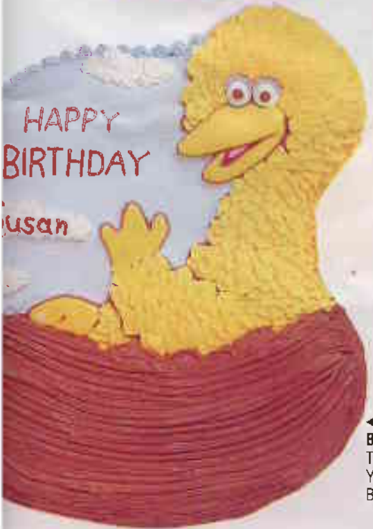
▶ Big Bird In Nest Cake Tips 3, 21 and Wilton Lemon Yellow, Red-Red, Pink, Sky Blue and Brown Icing Colors.